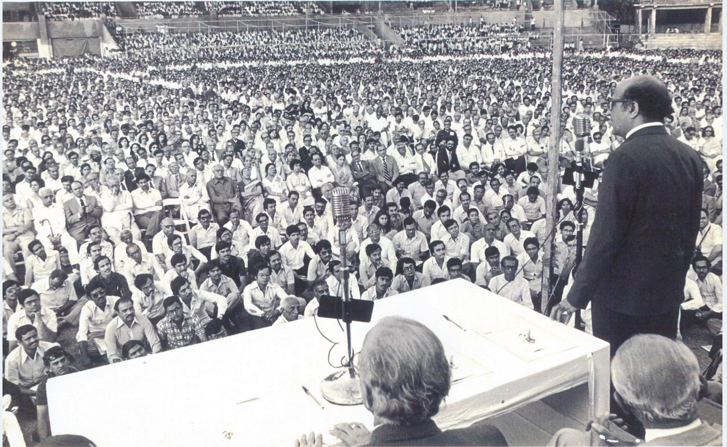
An audience mesmerized by the oratory of the late Mr. Nani Palkhivala, Former President, Forum of Free Enterprise.