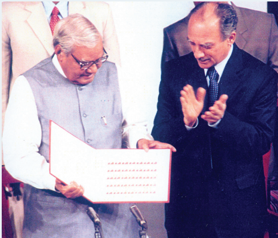
Release of a commemorative stamp in memory of the late Mr. Nani A. Palkhivala at the hands of the then Prime Minister of India, Mr. Atal Behari Vajpayee - seen with him is Mr. Arun Shourie, the then Union Minister of Communication.