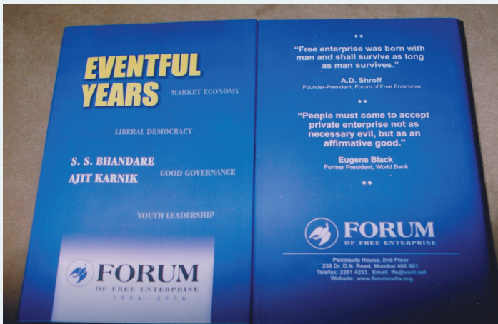
Capturing Forum's historical journey of 50 years in the book titled "Eventful Years" released on the occasion of its Golden Jubilee.